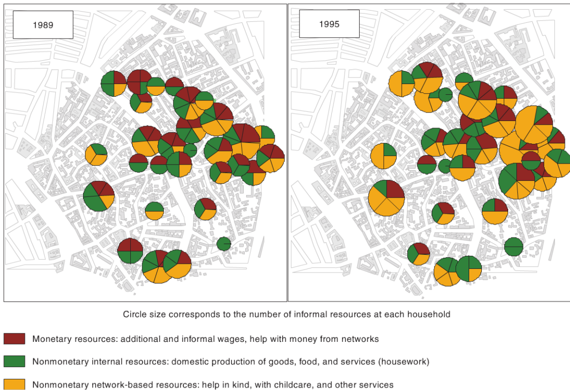
Figure 2 Informal resources and households, 1989–95. Reproduced from Pavlovskaya, M. E. (2004). Other transitions: Multiple economies of Moscow households in the 1990s. Annals of the Association of American Geographers 94(2), 329–351, with permission from Blackwell.

connected to seemingly impersonal global circuits of capital. These connections, however, are made invisible by scientific representations of the Earth, such as those originating from satellite imagery. These images ignore and mask the gendered experiences that are fundamental to the functionings of the transnational economy. The description and images from Biemann's work can be found on the Internet.