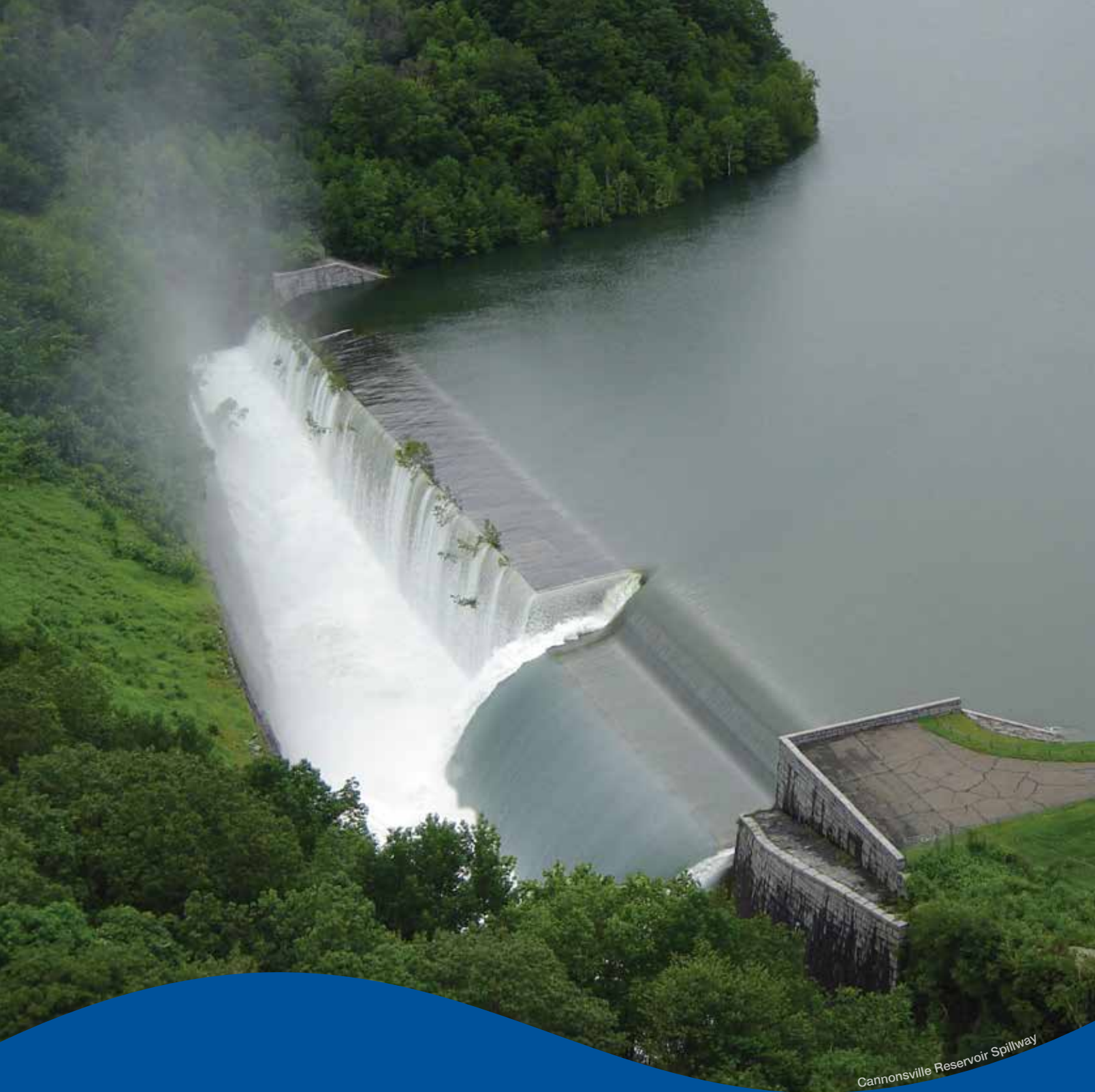
Cannonsville Reservoir Spillway