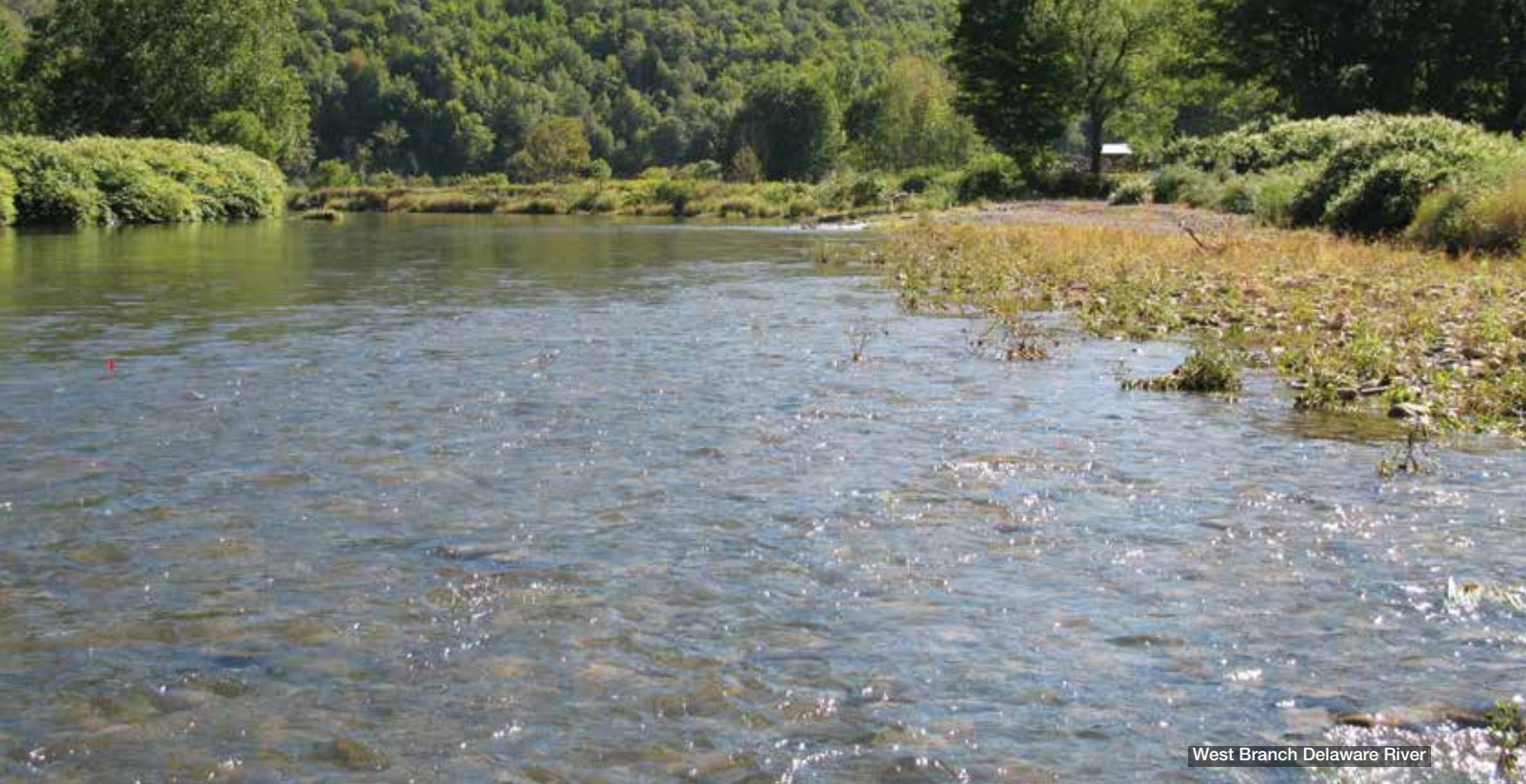
West Branch Delaware River