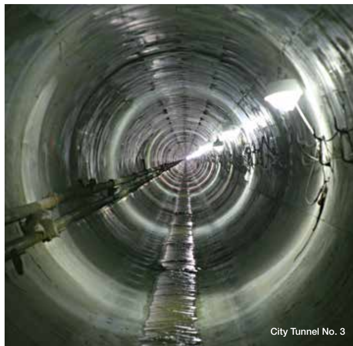
City Tunnel No. 3